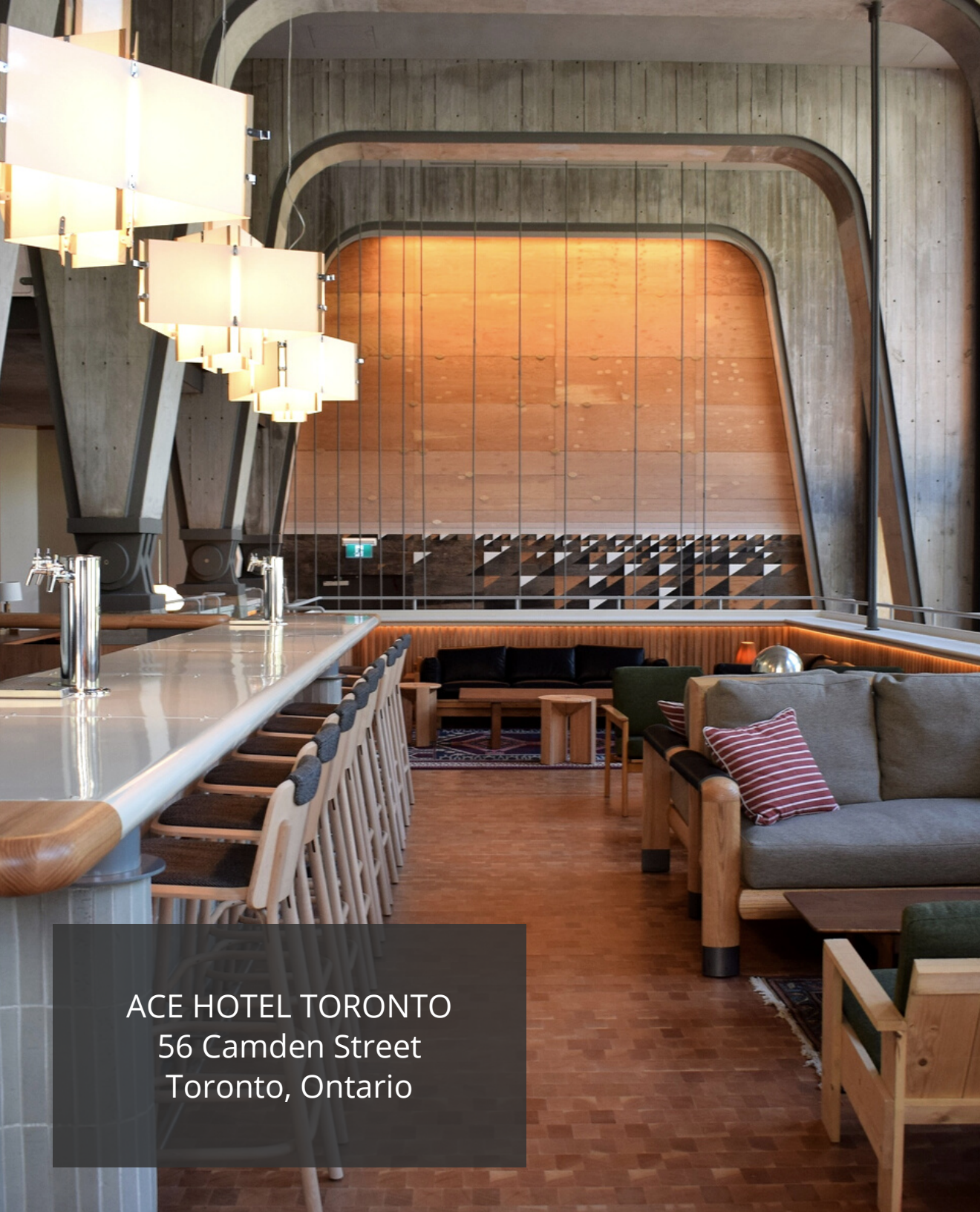
ACE HOTEL TORONTO 56 Camden Street Toronto, Ontario