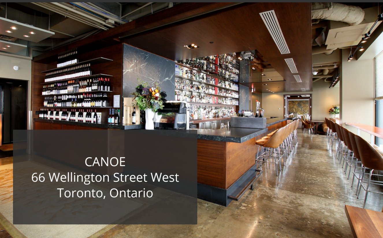
CANOE 66 Wellington Street West Toronto, Ontario